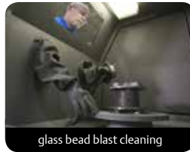
glass bead blast cleaning